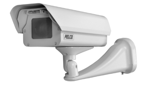
EH3512 ENCLOSURE WITH SUN SHROUD AND EM3512 MOUNT

The EH3512/EH3515 Series are indoor/outdoor, low cost camera enclosures constructed from die-cast and extruded aluminum. The EH3512 has a lower body length of 32.38 cm (12.75 inches) and the EH3515 has a lower body length of 40.00 cm (15.75 inches).