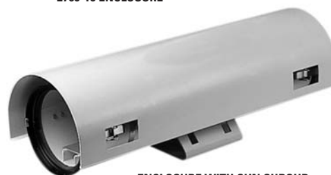
ENCLOSURE WITH SUN SHROUD

The E706 Series dust-tight enclosure permits the use of cameras in small-particle and dusty environments. The enclosure is constructed from aluminum and is also available in stainless steel for use in corrosive atmospheres.