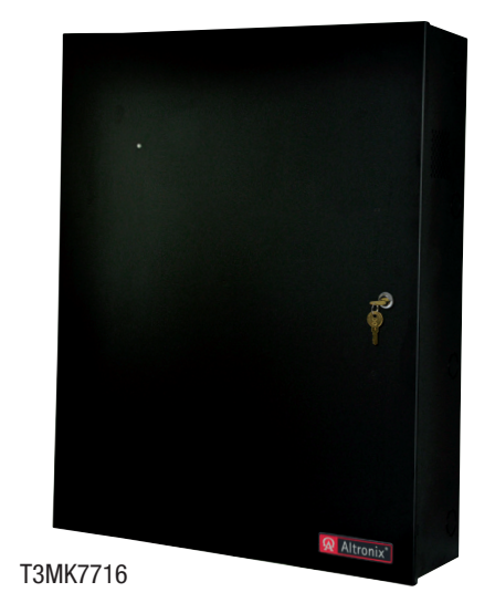
Mercury boards are not included