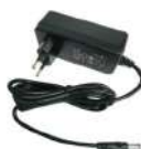
DC12V/3A Power Supply