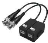
PFM800-E Passive HDCVI Balun