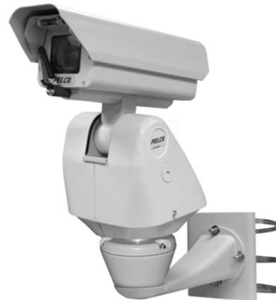
ESPRIT SE IOP SYSTEM WITH WIPER (SHOWN WITH WALL MOUNT AND POLE ADAPTER)

Pelco's ES40/ES41 Esprit® SE Positioning System features a receiver, pan/tilt, enclosure, and either an Integrated Optics Package (IOP) or a pressurized Integrated Optics Cartridge (IOC) in a single, easy-to-install system. Options include IOP or IOC models with or without wiper.