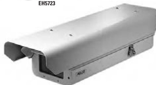
ENCLOSURE WITH SUN SHROUD

The EH5700 Series are indoor/outdoor enclosures designed for use with Pelco's medium and heavy duty pan/tilts or fixed mounts. Constructed of aluminum and available in a 23-inch (58.42 cm) length ( EH5723 ) and 29-inch (73.66 cm) length ( EH5729 ), these enclosures are designed to accept larger format cameras with either fixed focal length lenses or motorized zoom lenses.