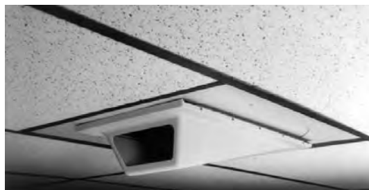
EH1000 MOUNTED IN DROPPED CEILING USING E1003 MOUNTING PLATE

The EH1000 is a low profile ceiling enclosure for use with large format cameras. The unobtrusive, streamlined design compliments any business or office decor.