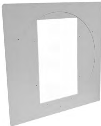
E1003 ROTATING MOUNTING PLATE