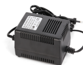
AC24V/3A Power Supply