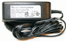
AD-1 POWER SUPPLY