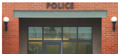
Law Enforcement DV-ML