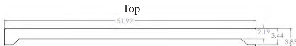
Diagram 1 IPSignl-RWB Dimensions