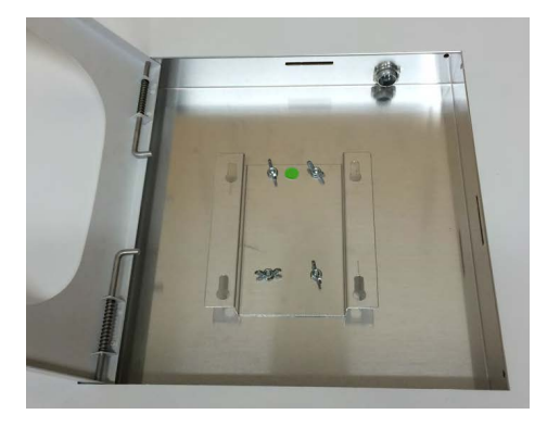
Integrated Mounting Plate, Cord Grip and Repositionable Door