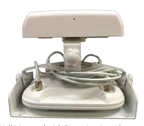
Shown Wall Mounted with Extension Arms Removed

The facts and figures herein are carefully compiled to the best of our knowledge and are intended for general informational purposes only. Responsibility for the use and application of AccelTex Solutions materials rests with the end user. All AccelTex Solutions products are sold pursuant to the AccelTex Solutions Terms and Conditions of Sale. © 2016 AccelTex Solutions. All Rights Reserved. AccelTex, AccelTex Solutions, the AccelTex Solutions Logo and other marks are trademarks or registered trademarks of AccelTex Solutions. Other products or service names may be the property of third parties.