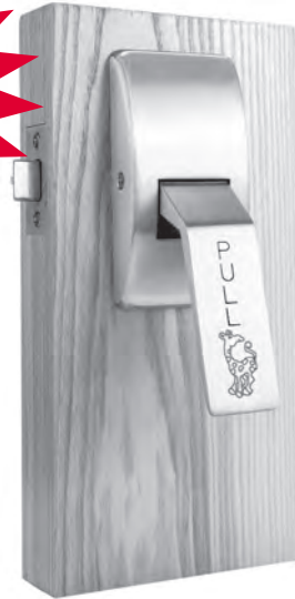
Optional Round Cover & Custom Engraving Shown

Optional "Q" Quiet Latch available - Zero decibels gained when operating the handles. Patent(s) pending.