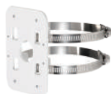
PFA152 Pole mount