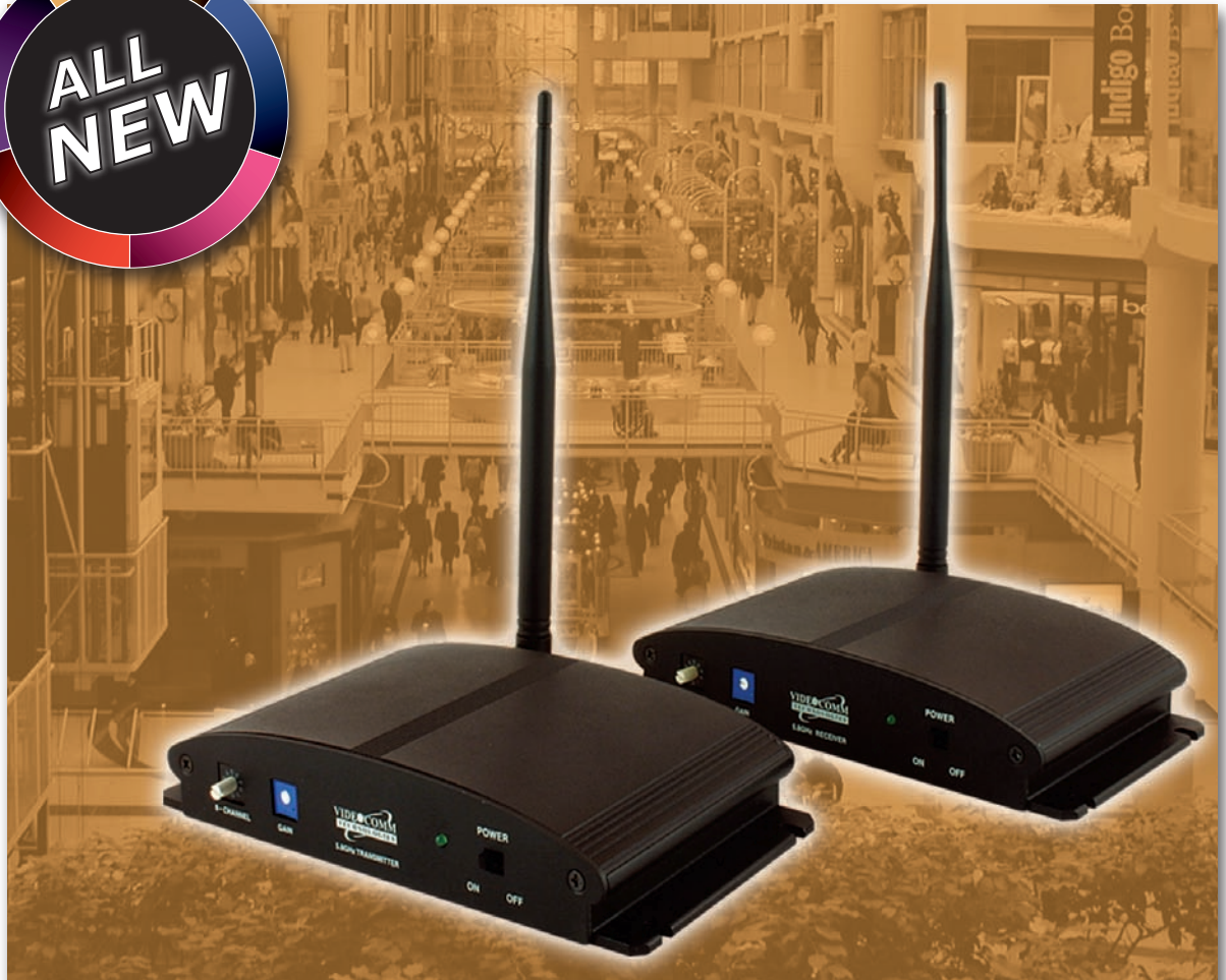
5.8GHz Desktop Transmitter & Receiver