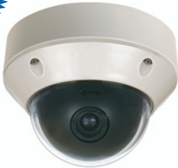
Flush Housing with Surface Mount Plate