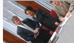
Tilted View w/ 2-Axis Bracket