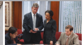
Perfect View w/ 3-Axis Gimbal