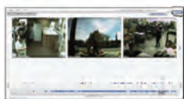
View content across cameras