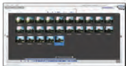
Quickly scan activity on one camera