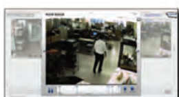
Fast one-click playback of recorded video

Simplified Installation: Ganz Cloud enables true zero-touch configuration installation. Plug a camera into a PoE (Power Over Ethernet) cable, log in to Ganz Cloud and start viewing video.