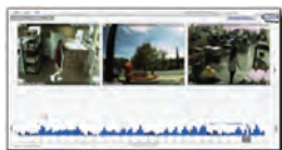
Quickly navigate months of data

Anytime, Anywhere Access: Live or archived video is available from your desk, your phone, or your laptop. Ganz Cloud works on all major browsers (IE, Firefox, Safari, Chrome), with no special plug-in to install, and no operating system limitations (PC, Mac, Linux support). Feature and smart phones (iPhone, Blackberry, Android, Symbian) can access video and events from any location, even on very slow wireless connections.