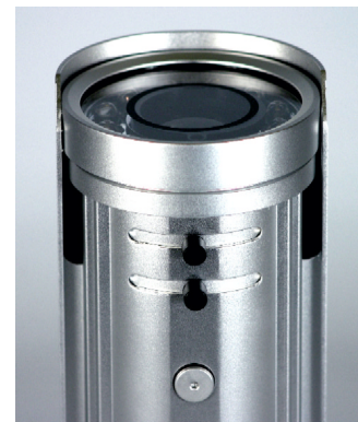
External lens adjustments