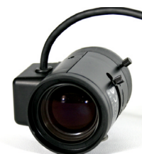
5-50mm IR-corrected lens