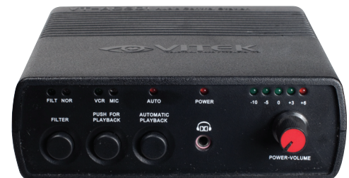
Easy To Operate Front Panel Controls