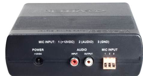
Rear Input Connections