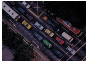
JVC Super LoLux™