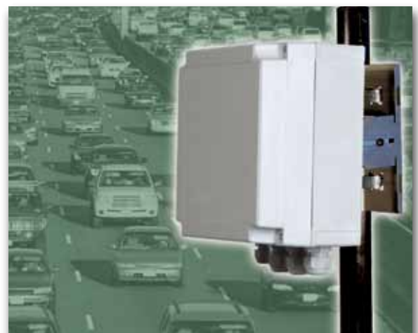
All Weather Applications