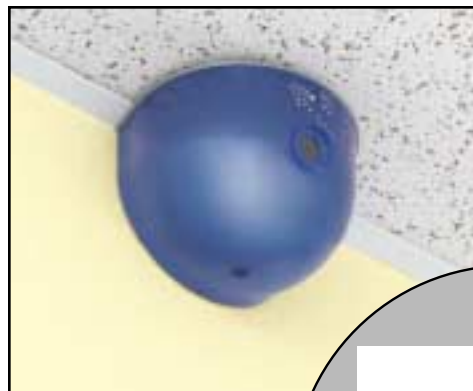
SW99-2033 — perfect for rooms or long hallways, or any view requiring a single lens

True Blue Beacon —You'll deter would-be perpetrators while reassuring employees and guests. The "true blue" LED, says Spyder is recording for you.