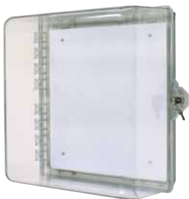
STI-7530 with Key Lock