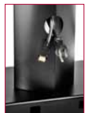
Internal cable management