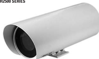
ENCLOSURE WITH SUN SHROUD

The enclosures of the EH2500 Series are rain- and dustproof to protect CCTV cameras from adverse environmental conditions.