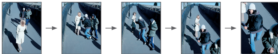
120 frame/sec @ D1 Resolution