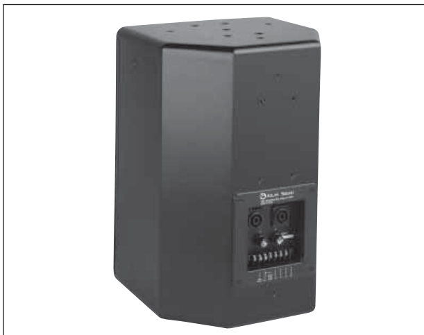
SM8SUB70-B (Back View)