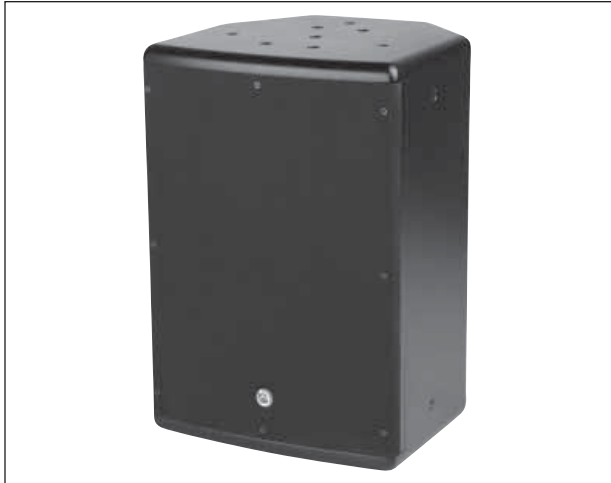
SM8SUB70-B (Front View)