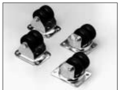
CT-500K Dual Caster Style ( Brackets and Hardware Also Included )