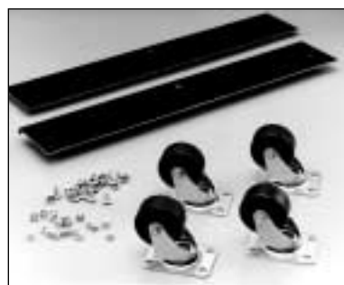
CT-5020K / CT-5030K Single Caster Style