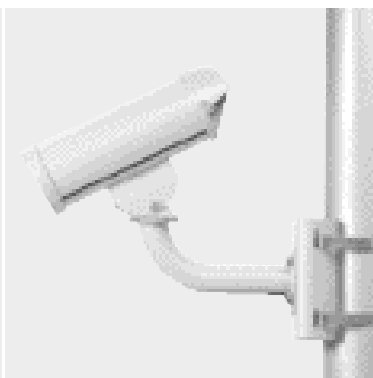
Optional pole-mount adapter (Model PMA-1)