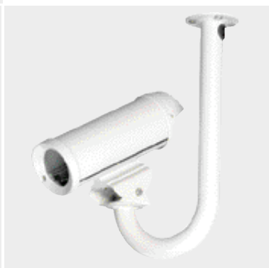
Optional ceiling bracket (Model JB1)