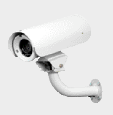
Optional sunshield (Model SS-1) for high temperature environments