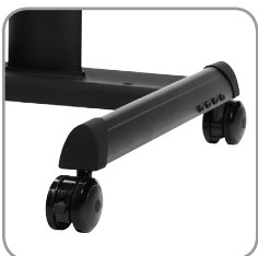
Caster base with locking wheels