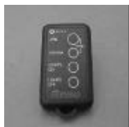
Keychain Remote (PKR02)