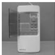
Security Console (PRO2000)