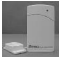
Door/Window Sensor (PDS01)