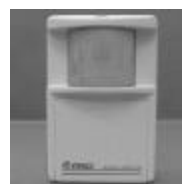
Motion Sensor (PMS01)