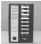
Handheld Remote (PSR01)