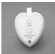
Emergency Pendant (PPR01)