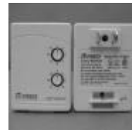
Lamp Module (PLM01)