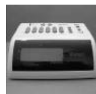
New Timer (PHT02)