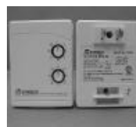
Appliance Module (PAM01, 2 PIN) (PAM02, 3 PIN)