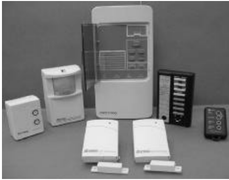
PRO2000 VP (7piece value pack)

Now you can offer your customers complete home security and home automation all in one inexpensive and easy-to-install package!