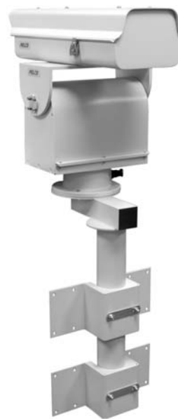
PP200 SHOWN WITH ENCLOSURE AND PAN/TILT

Because the pan/tilt mounting arm is built-in, you need only to purchase the appropriate pan/tilt adapter (PA2000 for medium duty pan/tilts or PA2010 for heavy duty pan/tilts).