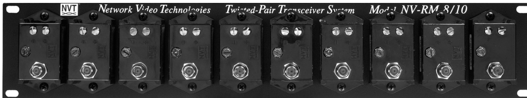
(Shown with ten NV-213As)