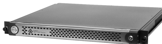
NET5308T-EXP (OPTIONAL 8 INPUT EXPANSION UNIT)