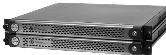
NET5308T (INCLUDES 8 INPUTS AND BASE MODULE)