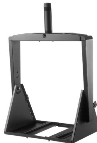
(SAFETY STRAPS NOT SHOWN)

An 8-inch (20.32 cm) section of 1.5-inch NPT threaded pipe is furnished with the mount to allow for either ceiling or wall mounting. Two optional adapters are available: the MRCA for ceiling mounting and the MRWA for wall mounting.