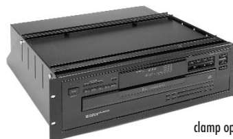
RSH4A clamp option with unit installed