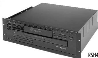
RSH4A custom rackmount with unit installed