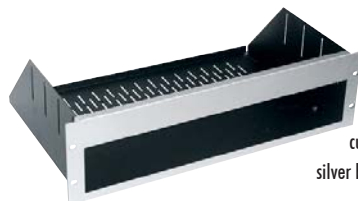
RSH4C custom rackmount silver brushed and anodized