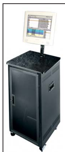
PTRK-14MDK (shown with optional LCD mount)