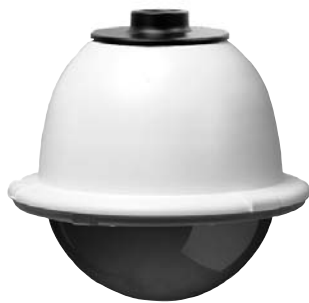
JK-PHI Indoor Housing