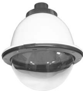
JK-PHO Outdoor Housing