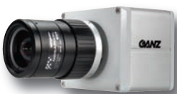
MPDN Series Cameras 1.3-5 Megapixel True D/N 1/2" CS-MT