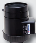
TG5Z8513FCS-IR 8.5-40mm IR 1/3" CS-MT F1.3