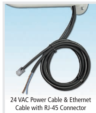
24 VAC Power Cable & Ethernet Cable with RJ-45 Connector