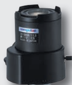
TG4Z2813FCS-IR 2.8-12mm IR 1/3" CS-MT F1.3