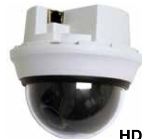
H3D2F shown with mounting ring for surface mount