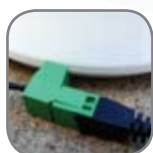
Power (dome camera)