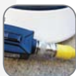
Video (dome camera)