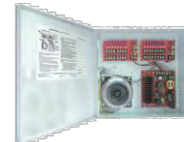
High-Amp DC Power Supply