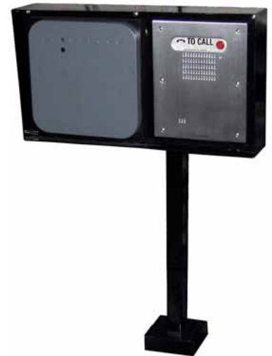
Shown with ETP-400C and card reader