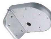
BA-EMDS: "L" Style Wall Mount Bracket for ED550T