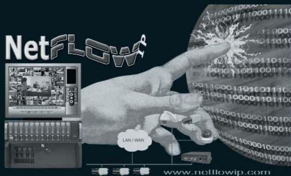
Megapixel NVR Hybrid Scalable from 4 to 64 Channels