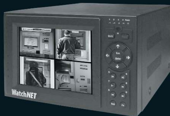
Real Time Stand Alone ATM DVR