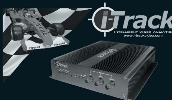
Intelligent Motion Tracking