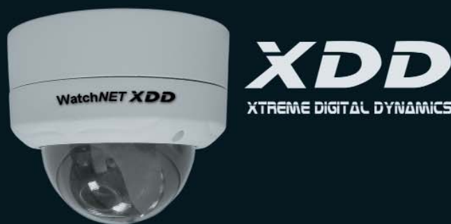
Ultra Hi Resolution Vandal Dome Camera

Canada 351 Ferrier Street, Unit 5 Markham, ON L3R 5Z2 Toll Free: 1-866-843-6865 Tel: 416-410-6865 Fax: 1-866-331-3341