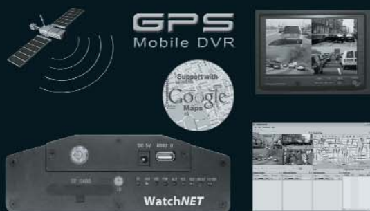
Mobile DVR with Real time GPS Tracking/Viewing