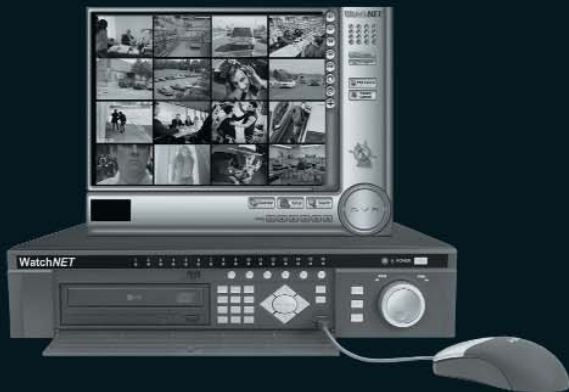
Embedded 8TB DVRs, CMS & PTZ with Auto Trace Function & POS Integration