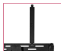
Wall Plate Spacers (Sold separately)