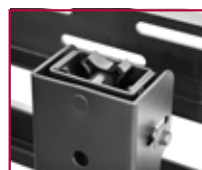
Tool-less Micro Adjustments