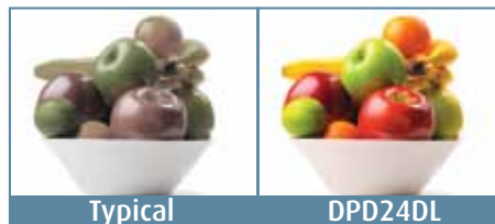
Superior Color Reproduction