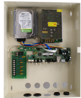
Inside of unit

For the latest mobile apps and CMS software go to: www.specotech.com/DVRApps